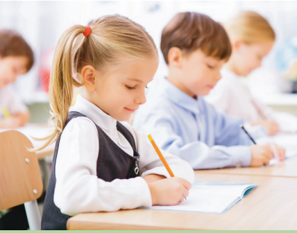
Investing in life's priorities

We aspire to deliver the results you expect and the service you deserve, and are committed to continually earning your business throughout the course of our relationship.