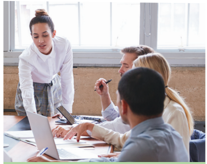
Protecting what matters