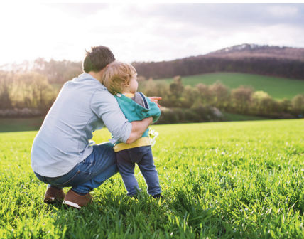
Leaving a legacy